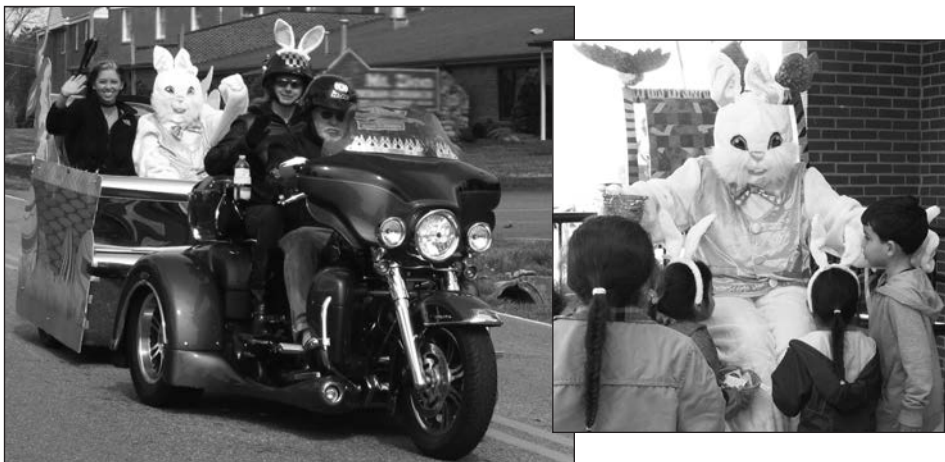
The annual Bunny Run for Sipe's was a treat for our children. Sponsored by Blue Ridge Harley Davidson, this event not only raises money for the Blessings in a Backpack program which benefits the four-year-olds in the Tyndall Center, it also provides many needed items for the older youth in Houston Cottage.